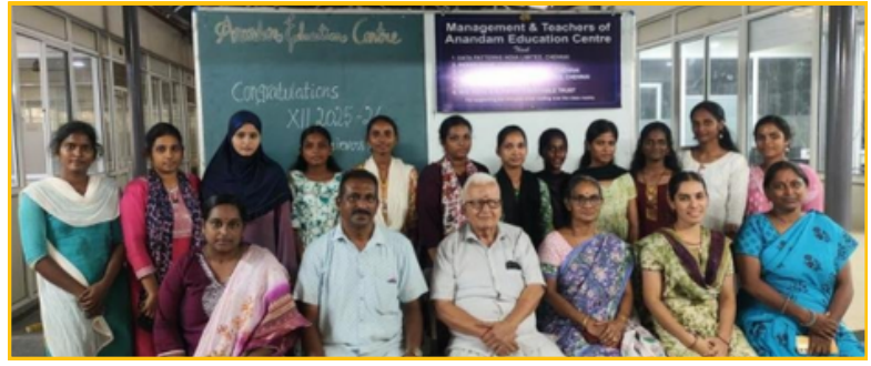
CLASS XII TOPPERS