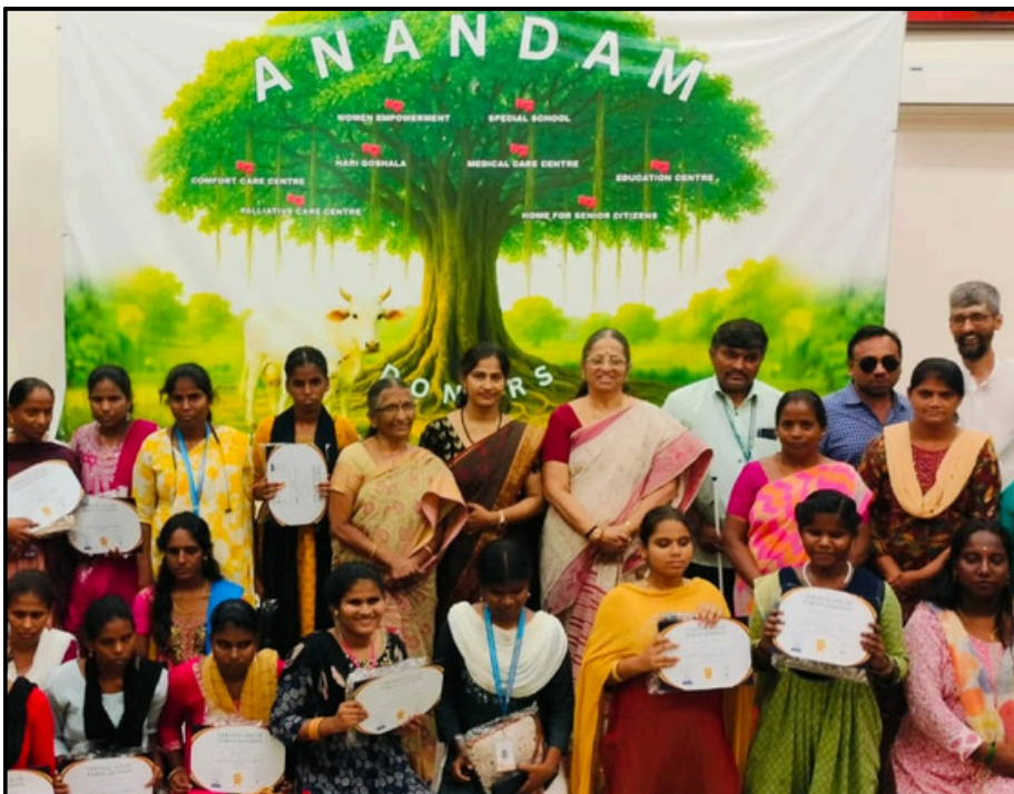
PAGE 6 | 15 DAY RESIDENTIAL CAMP FOR VISUALLY IMPAIRED STUDENTS