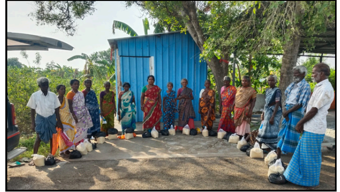
Free Monthly Provision Distribution for Needy Families

By the grace of God, this season's rice harvest from Anandam Hari Goshala's own farming land has been completed successfully. The harvested rice bags will directly nourish our Anandam elders and will also be distributed to poor families in nearby villages – a true blessing of abundance shared with love.