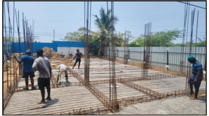
Column Footing & Raft Beam – Completed