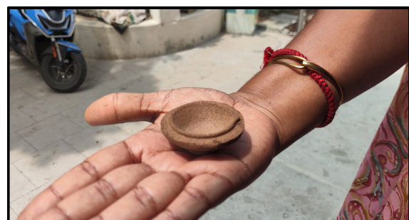
Panchakavya Lamp & Dishwasher

Pure A2 ghee made from Goshala cow milk using traditional bilona method.