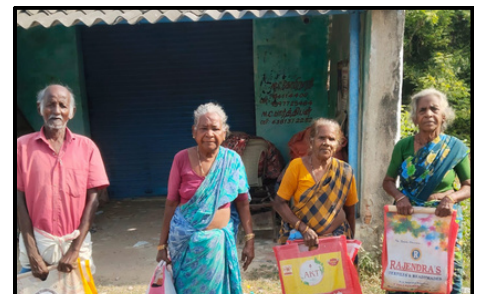
PAGE 7 | FREE PROVISIONS FOR NEEDY