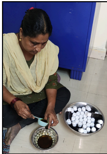
Pain Relief Oil & Balm

Sacred incense sticks and cup sambrani from cow dung – purifying and aromatic.