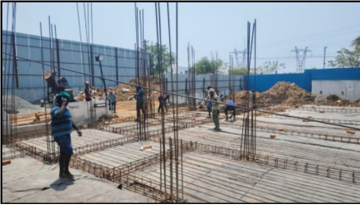
Foundation & Reinforcement Work – Underway

Construction Progress Update – May 2026 Building with Faith • Serving with Compassion