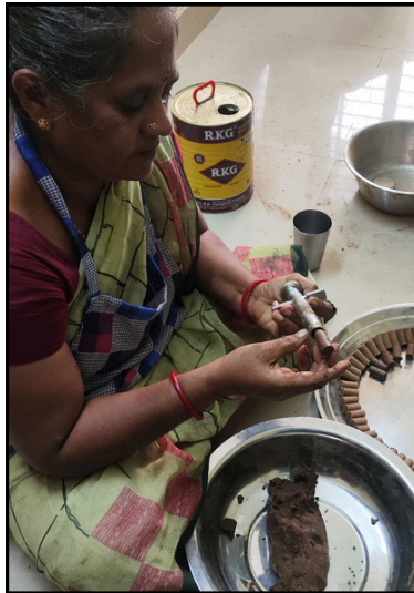
Dhoop Sticks & Cup Sambrani

Sacred incense sticks and cup sambrani from cow dung – purifying and aromatic.