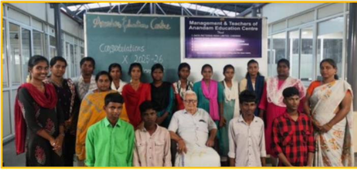
CLASS X TOPPERS