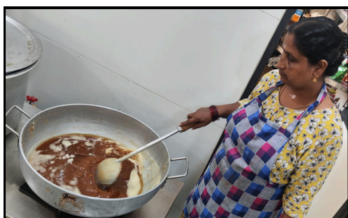
Cow Ghee (Cow Ghrit)

Natural tooth powder from purified cow dung ash, clove oil, rock salt, thymol, green camphor – free of chemicals.