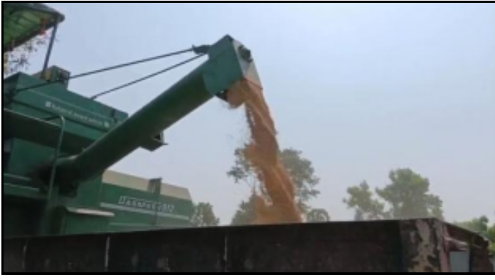
Bountiful Rice Harvest from Our Goshala Farm Land!

By the grace of God, this season's rice harvest from Anandam Hari Goshala's own farming land has been completed successfully. The harvested rice bags will directly nourish our Anandam elders and will also be distributed to poor families in nearby villages – a true blessing of abundance shared with love.