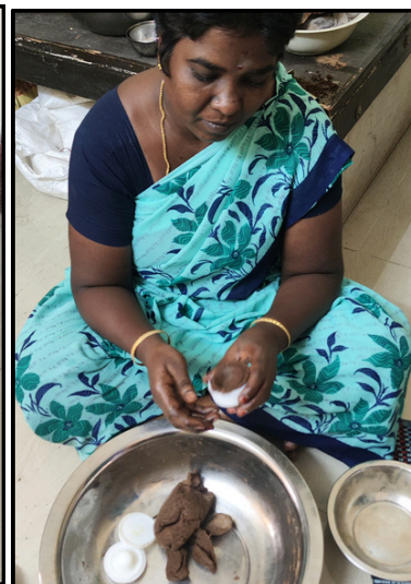
Vibhuti & Muligai

Herbal pain relief oil and Cow Ghrit Balm from cow products and medicinal herbs.