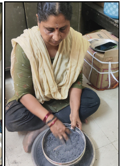
Cow Dung Tooth Powder

Sambrani Powder Holy ash (Vibhuti) and herbal Muligai Sambrani powder from sacred cow dung.