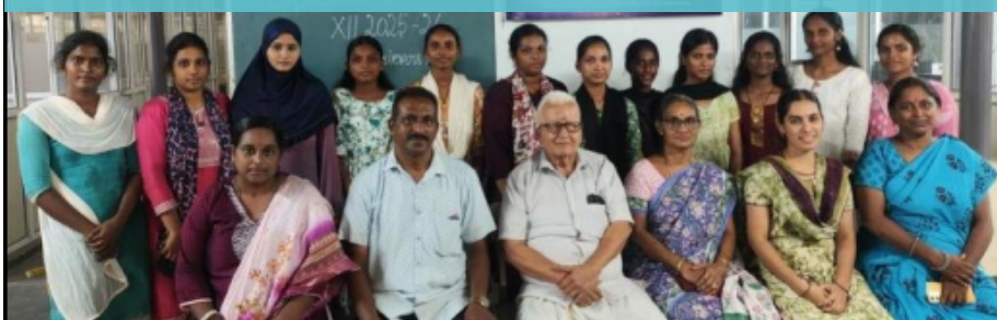
PAGE 4 | CLASS 12 TH TOPPERS IN EXAM