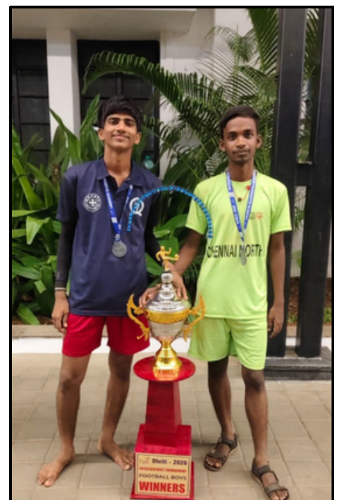
PAGE 6 | FOOTBALL CHAMPIONS AT DHRITI '26