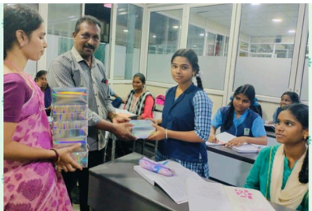
We have 270 students from class III to class XII and 25 dedicated teachers.