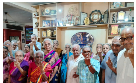
PAGE 4 | VOTING - OUR RIGHT!