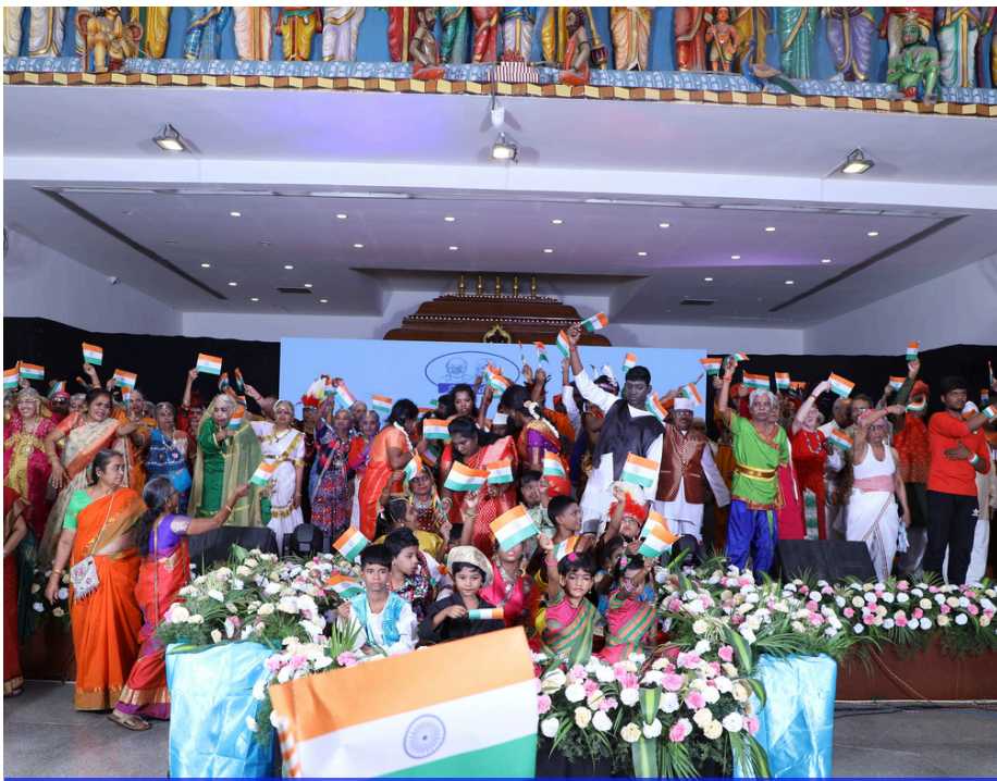
PAGE 3 | ANANDA BHARATHAM - ANNUAL DAY