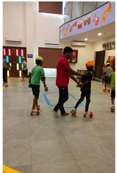
PAGE 10 | SUMMER CAMP !