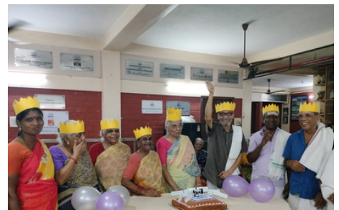
PAGE 4 | BIRTHDAY'S AT ANANDAM