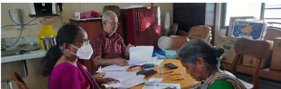
PAGE 7 | MEDICAL CAMP AT MELKONDAIYUR