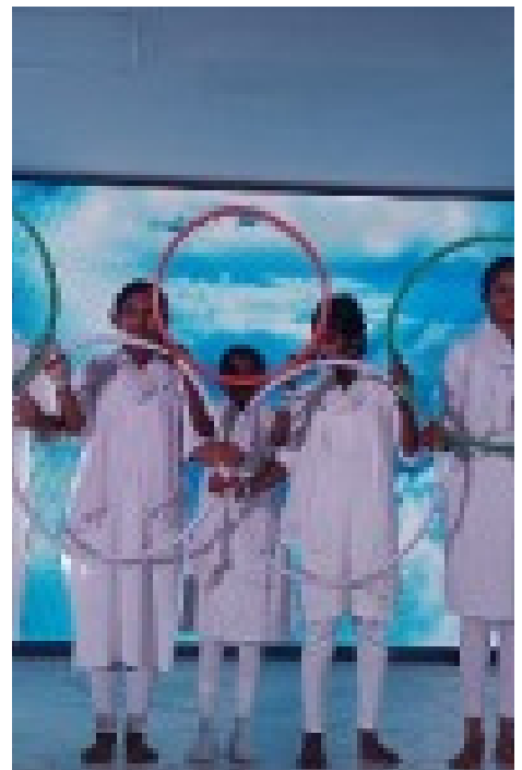
PAGE 9 | VEL'S CARNIVAL ATTENDED BY STUDENTS