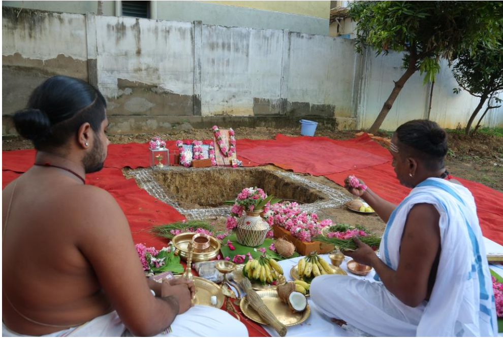
Image: Bhoomi Pooja being conducted on 27 th July 2021

The building plan has already been approved by CMDA and we have commenced the construction works which is all set to be completed by June 2022.