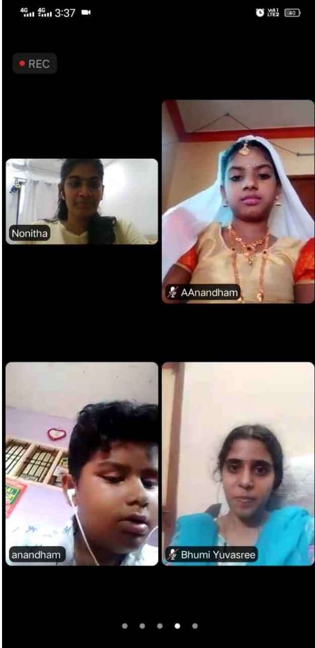
Image: Our students participating in the Zoom competitions conducted by Bhoomi Trust.