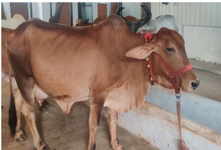
Image: One of our divine bovines by name Padma

We are very happy to share that Anandam has started a Go-shala in the name ANANDAM HARI GOSHALA at Lenin Nagar, Ambattur in February 2021. We now have 10 cows, all of Indian Breed, donated by well-wishers. Devotees coming to the temple also worship the Go-Matha at the Go-shala.