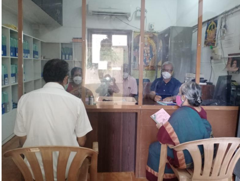
Image: Volunteers at AMCC registering patients from behind a glass partition

As soon as the pandemic phase-I subsided in March 2021 and the Government lifted the Lock Down, we had commenced regular functioning of the Medical Centre, strictly following the COVID Protocol. The patients started coming slowly.