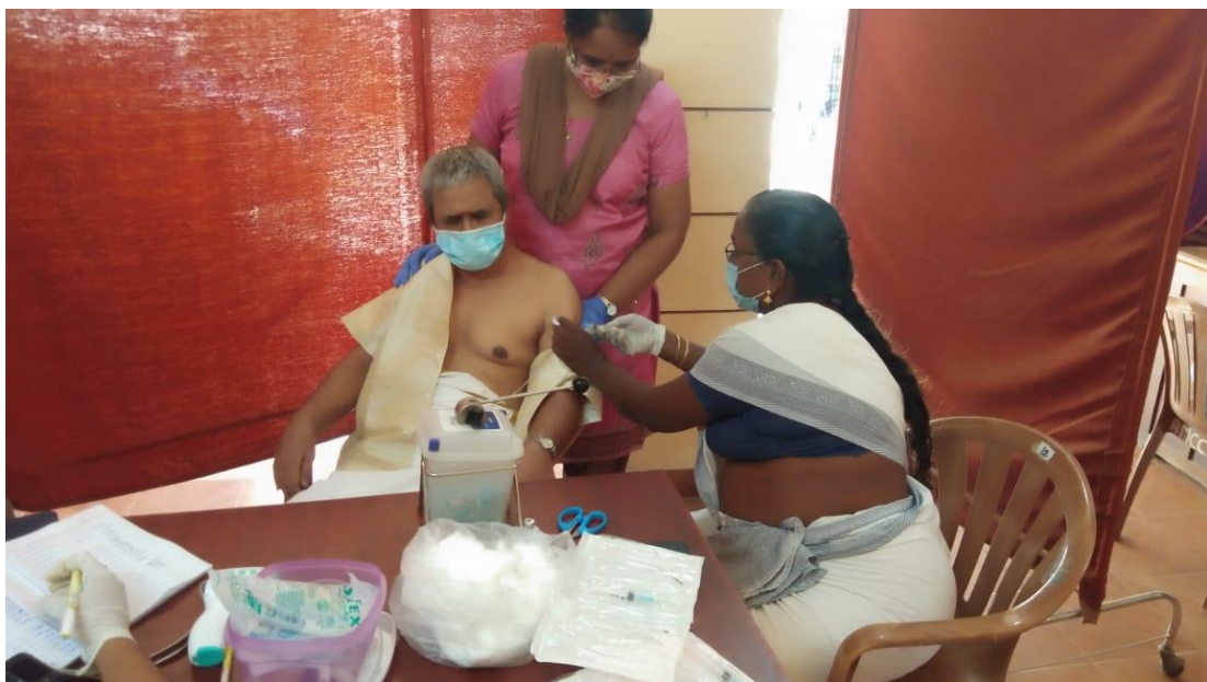
Image: Pneumonia vaccine being administered to a resident of Anandam