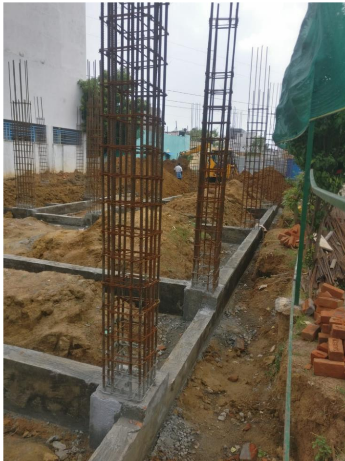
Image: Progress of construction so far

The building plan has already been approved by CMDA and we have commenced the construction works which is all set to be completed by June 2022.